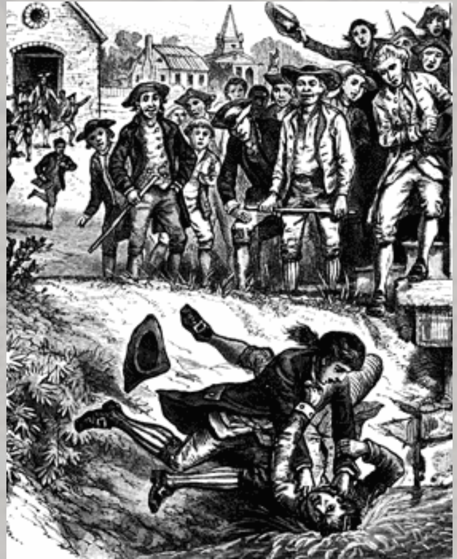
"A scene at Springfield, during Shay's Rebellion, when the mob attempted to prevent the holding of the Courts of Justice."—E. Benjamin Andrews, 1895