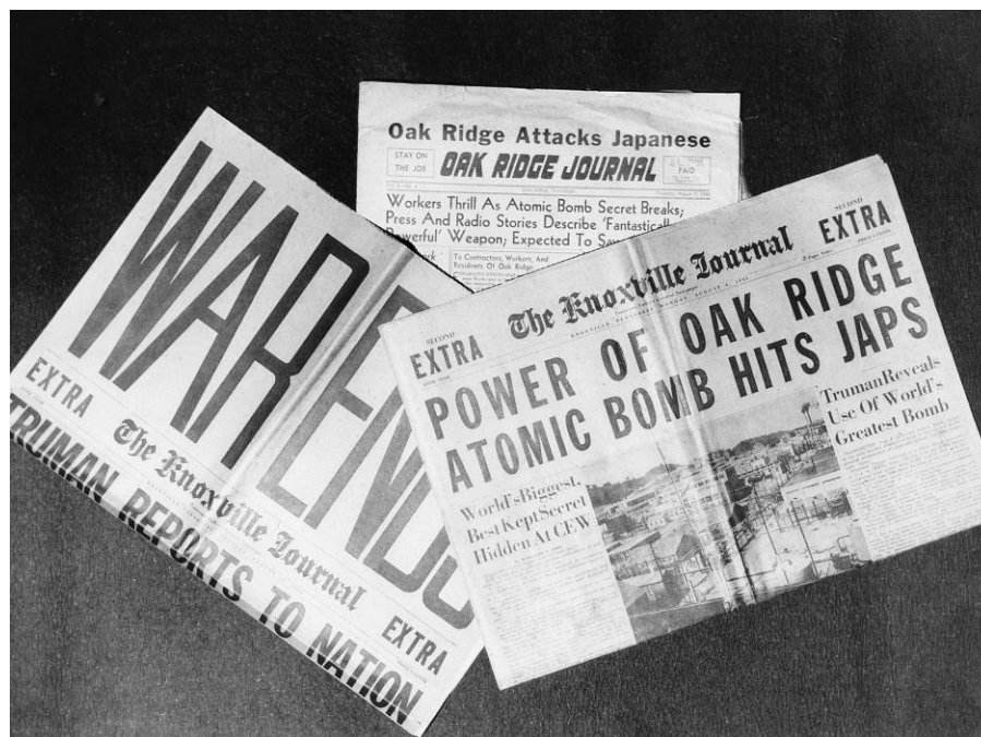
Newspapers announce the end of World War II