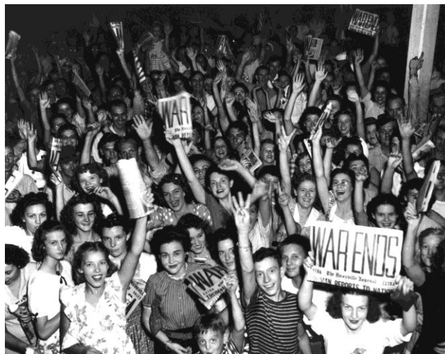
Famous "War End" photo by Ed Westcott shows the jubilation exhibited by Oak Ridger's at the news that the awful killing war was over