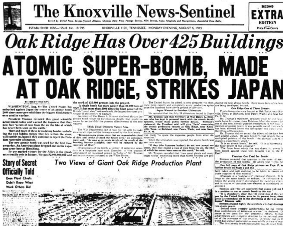
Newspaper published on August 6, 1945, the same day that Little Boy was dropped on Hiroshima the first of two atomic bombs leading to the end of the war